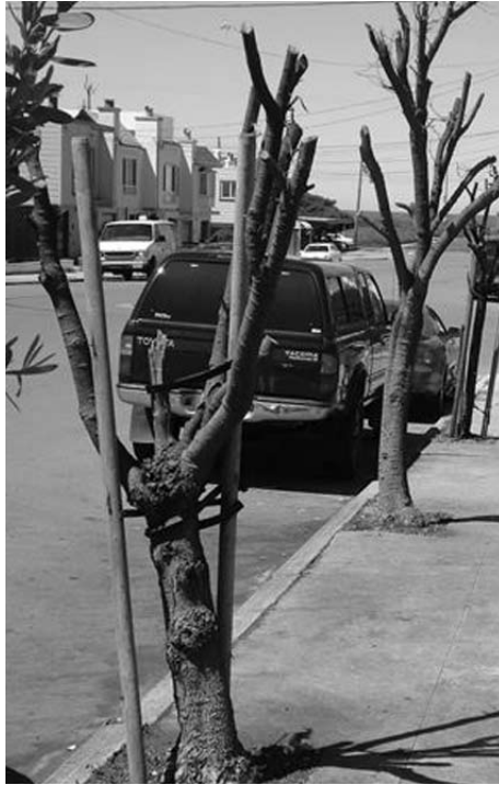
We are all responsible for the skilled pruning of the street trees on our property.

At an alarming rate, San Francisco is losing the environmental and aesthetic asset of its mature urban forest to illegal ‘pruning,’ or topping. Friends of the Urban Forest needs your help NOW. Please report these obvious and blatant acts to urbanforestry@sfdpw.org providing accurate information on the damaged tree address, company or individual doing the ‘job’ (if available) and, if possible a digital picture of the tree. CC: doug@fuf.net as well and we will help and follow up with the Bureau of Urban Forestry.