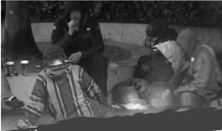
Increased police surveillance has made a dent in late night carousing.