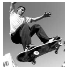
Event on July 25 stunned neighbors.

Then came the event of July 25. Without any notice to neighbors, there was a full-blown skateboard event at the location with loud speakers, blaring music and, of course, a group of avid skateboarders performing their moves on ramps. The on-line ad read: “Redbull Manny Mania Hits SF at Waller and Stanyan – Come watch skaters battle it out for two-wheel supremacy.”