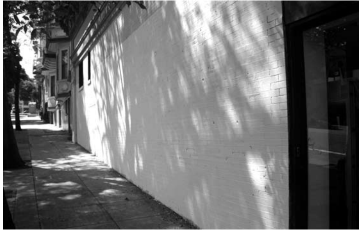
Southwest corner of Masonic and Haight Streets invites tagging.