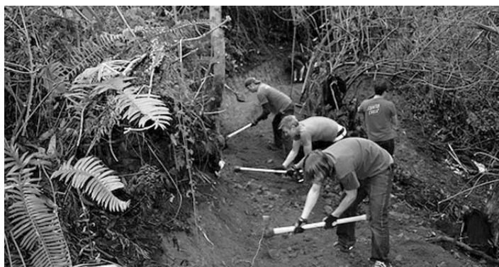
Even though Rec and Parks' entrance to the Stanyan Trail Head has been boarded up by neighbors, volunteers continue their work clearing the historic trails within Sutro Forest.

As nice an idea as it is to reopen this trail leading from Stanyan Street into Sutro Forest, it will disproportionately effect homeowners on either side of the trail. At the meeting, they stood firmly against the proposal. Their objections ranged from an increased danger of