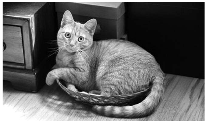
"Little Girl"

Have you found a stray cat in Cole Valley? There's a new online blog with a wide variety of information both for cat owners and those who have found lost felines. Go to http://colevalleycats.blogspot.com and read about the hapless tabby named Henry. Another entry calls Cole Valley "Cat Heaven" and thinks cat owners should exchange tips on solving the many problems of keeping a cat in an apartment.