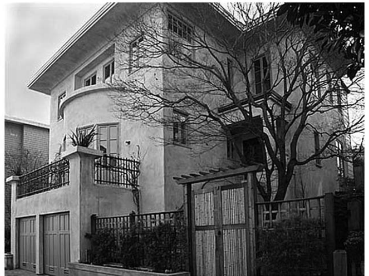
You can see the interior of the Mayor’s new digs at www.socketsite.com .

The mayor and his missus have moved into 1581 Masonic Avenue and, face it, no matter what your politics, it’s kind of nice to know the Mayor and his wife, Jennifer Siebel Newsom, chose our neighborhood to live in. But exactly what neighborhood would