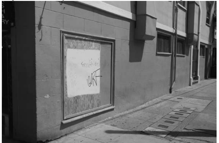
The wall at the northeast corner of Carl and Cole greets passengers disembarking from the N-Judah.

Meanwhile residents of Cole Valley are discussing another blank wall, this one at the corner of Carl and Cole, along the side of the Laundromat. As the N-Judah emerges from the tunnel, it is the first stop in Cole Valley. "There should be some well-designed mural