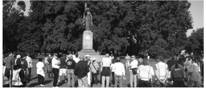
The Harding monument was one of several volunteer meeting points for the District 5 cleanup.

The sun shone on the 700 volunteers who participated in the District 5 Clean-Up on August 8. The main group met in front of the Harding monument at Fell and Baker streets at 9 a.m. and lis-