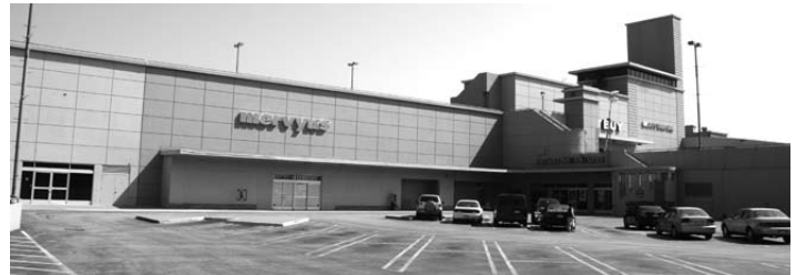
Marshall’s will replace Mervyn’s as the anchor store in the old Sears building on the corner of Masonic and Geary.

Mervyn’s was one of the city’s first large clothing stores to go under when the recession hit. The space on the corner of Geary and Masonic which for so many years was a Sears, has been dark for nearly a year. On August 6, clothing giant TJX (owners of TJ Max and Marshall’s) announced that they had received city approval for