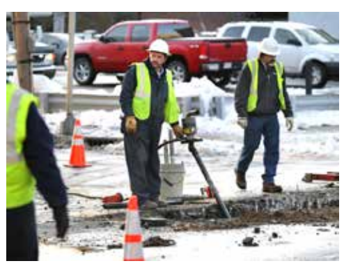
Customers evacuated Haight shops as gas spread.

What do you have to do in this town to get punished for a crime? Jen Longley of the Usual Suspects reported that, finally, "San Francisco can remove the subcontractor deemed responsible for