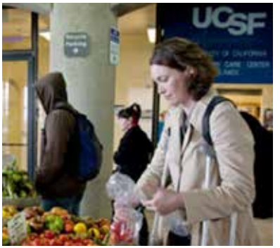
Since the demise of the Waller farmers' market, UCSF fills a neighborhood need.

This market features a seasonal selection of freshly picked organic vegetables at reasonable prices. There are also organic berries and a selection of fruits and nuts that, while not organic, are