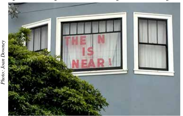
Carl Street neighbor celebrates his "transit rich" neighborhood.

Replacing the longitudinal seats with transverse or forward-facing seats isn't straightforward since the longitudinal ones are lighter