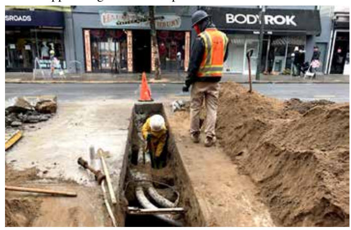
Street work will have a major impact on the Haight's commercial life.

With the first phase completed, the second and major stage of the "Upper Haight Transit Improvement and Pedestrian Realm