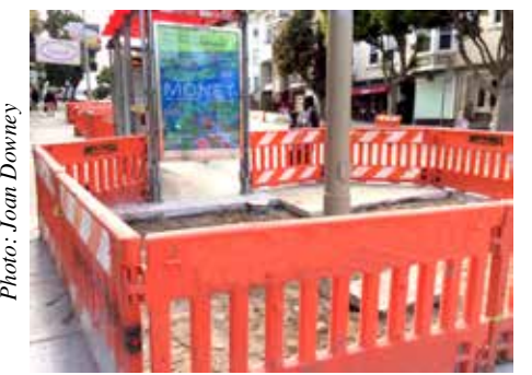
Long delayed street enhancements are coming to Cole Valley Muni stops.

To refresh your memory, Muni got money from a variety of sources (CalTrans, GoBond (Prop A) Sales Tax, General Fu, MTC and FTA) to build bulb-outs of sidewalks at transit stops all over town. The reason was to protect boarding passengers from automobile traffic. Once constructed CVIA wrote letters demanding that the extra space of blank concrete