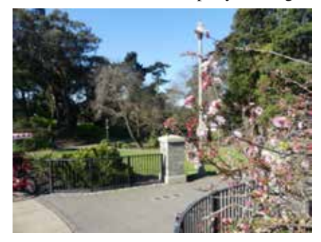
Eastern entrance to Golden Gate Park needs a little love. Volunteers provide it.

Meet at Haight and Stanyan Street. Look for the Rec and Park vehicle to locate the work party. We begin at 9 am and finish by noon.