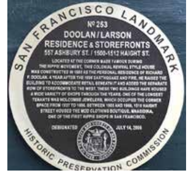
The building had already been declared a San Francisco Landmark in July 2006.

in the 60s when prices were low. But now the three-story, 7,500 sq. ft. structure belongs to SFH. We learned that they have been negotiating with the National Trust to turn it into a museum focusing on Haight Ashbury history. Staff assured me that this would be done " only after full input from neighbors." They may know that, although merchants have long been in favor of a Haight Ashbury museum, residents fear more tourism and, particularly tour busses, brought into the neighborhood.