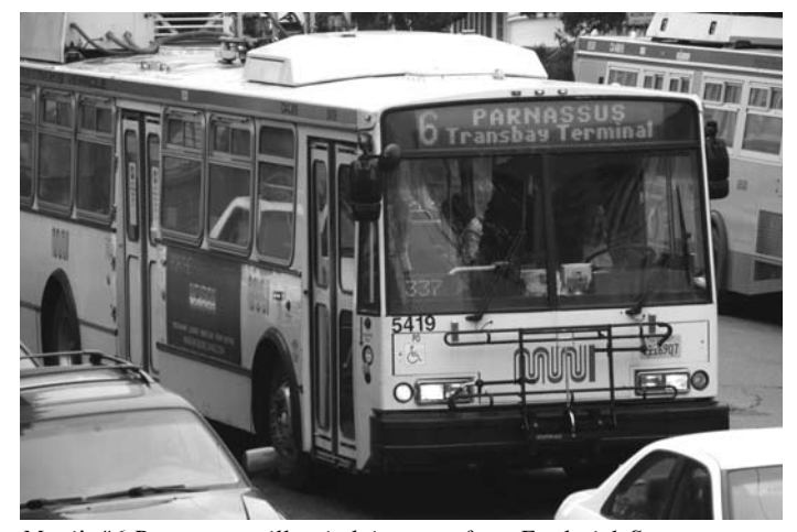
Muni's #6 Parnassus will switch its route from Frederick Street to Haight Street replacing the #7 line.

SFMTA director Nathaniel Ford says, "The package of recommendations could result in changing nearly half of Muni service as we know it today to more effectively meet customer needs and market demand. The recommendations made by the Transit Effectiveness Project (TEP) are projected to increase the number of daily