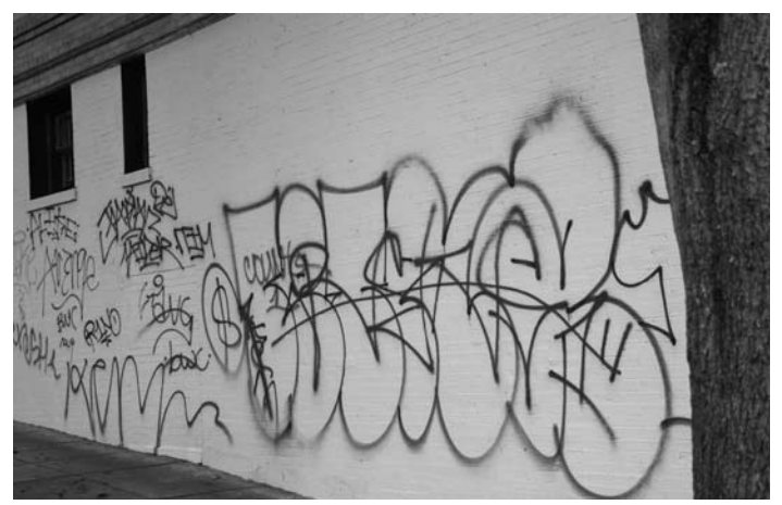
SF Police keep photographic records of "tags" which help them identify vandals. If caught, they are subject to 96 hours of community service.

If it persists photograph the graffiti before you remove it and file a police report by going to www.sfgov.org/site/police_index. asp. Click on "online report", then on the blue "vandalism/graffiti"