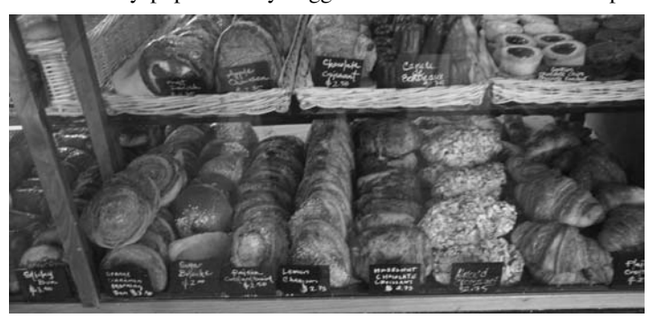
Just some of the more than 80 products baked fresh each day and sold at Boulange de Cole.

In addition to their remarkable assortment of pastries and breads, Boulange de Cole does quite a business in food preparation. Justin says tuna is a big thing here. "Both our Salade Niçoise and our Tuna Melt are very popular." My suggestion: Don't overlook the open