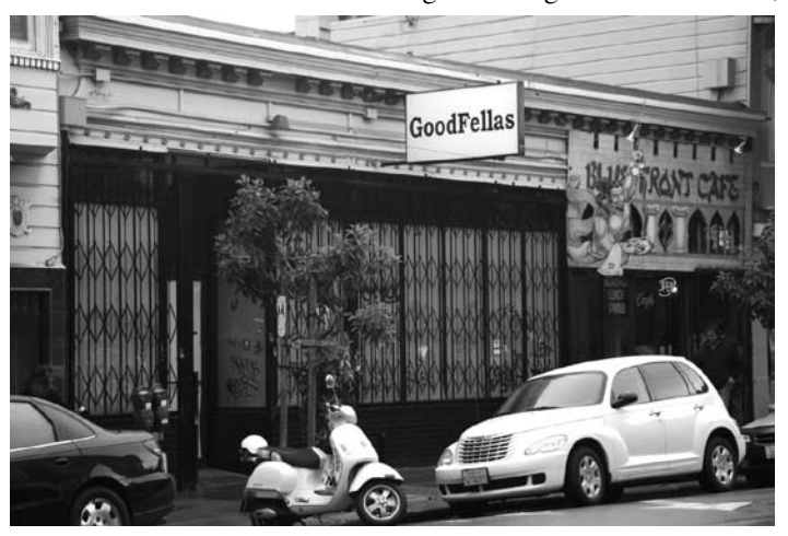
If "GoodFellas" succeeds in occupying the space recently vacated by Discount Fabrics, it will become the 13th shop selling drug paraphernalia in the Haight.

The word among other merchants is that relatives of "Daydreams" in the 1500 block of Haight had signed the lease and,