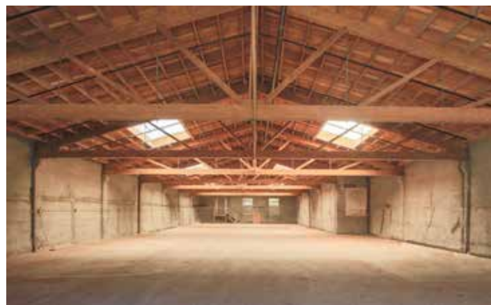
The interior of 930 Cole Street as it looks now.