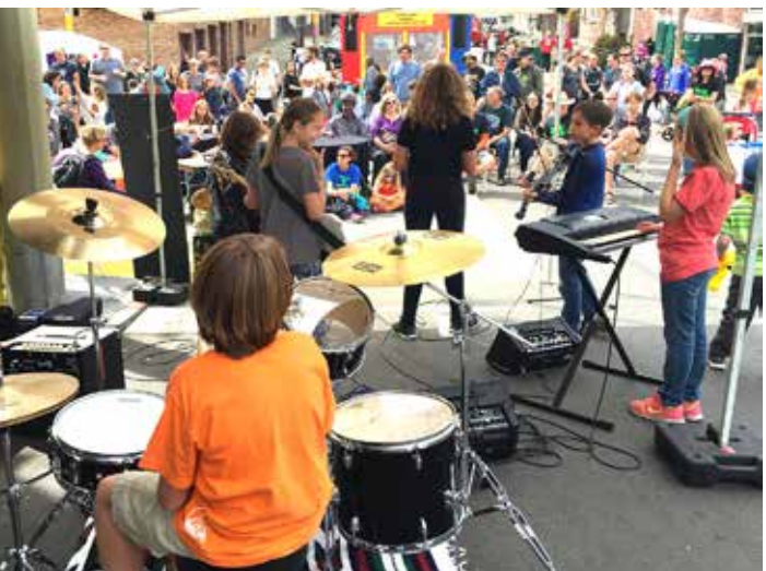
A band from Grattan Elementary School was a crowd pleaser.

Hill, and A Talent for Mischief came back this year and were joined by a couple of bands composed entirely of students from Grattan