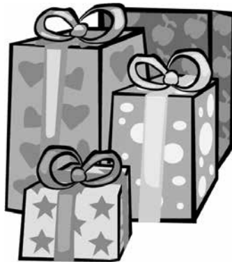
Photo with Santa Helps Fund Clean Cole Street Program

When you shop at our neighborhood businesses, you’re supporting the economy of the place you live. It’s a simple fact: for every $100 spent, locally owned independent businesses generate $68 in local economic activity. National chains generate only $43. And out-of-state online sellers who don’t collect sales tax are virtually a total drain on the local economy. So when you spend your hard-earned money here, it stays here, supporting neighborhood businesses and enhancing the quality of life in Cole Valley and the greater Haight Ashbury.