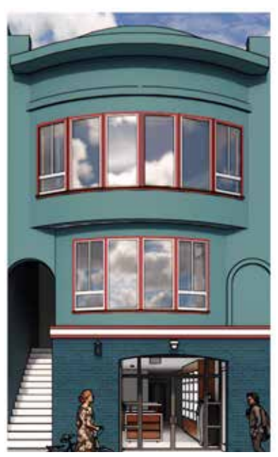
What is now a residential garage will become a cannabis dispensary.

The City has given its approval to the application for opening a cannabis shop at 768 Stanyan, next door to the