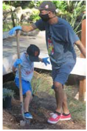
the Alvord Lakelet in Golden Gate Park. Connect with this magnificent park and help give back to the community. We begin at 10 am and finish by noon.

Saturday, November 28 is the fourth Saturday of the month and volunteers are needed to help park gardeners at