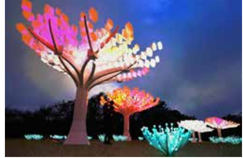
More than 2,000 LED bulbs clustered into small flowering bushes at varying heights will fill Peacock Meadow.

Called "Entwined," by San Francisco artist Charles Gadeken, the installation will run through February 29 to honor Golden Gate Park's 150th Anniversary. Says Rec and Park, "It will create a whim-