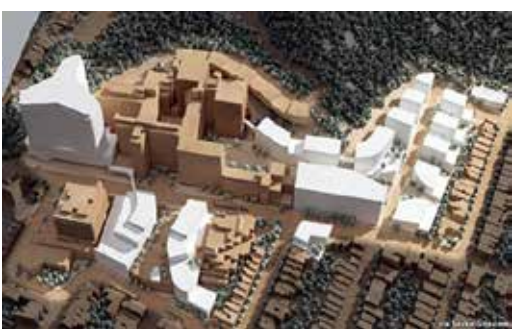
UCSF will expand from 3.5 million to 5 million sq. ft.

development. The hospital supportand ing buildings would increase economic development and workforce housing for entire the southeast area, while al-