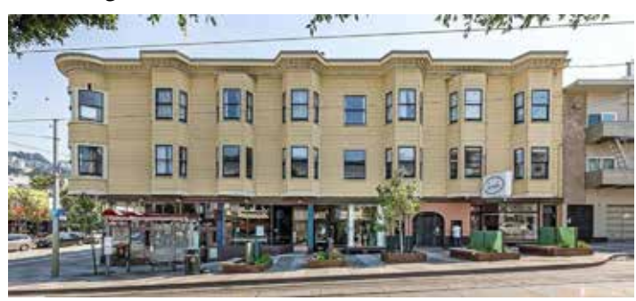
103 Carl Street recently underwent a "soft story" upgrade. No small task in a building this size.

The massive corner building on Cole and Carl (103 Carl Street), home to Padrecito, Mane Attraction and Lavande has been on the market for two months. Offered by Compass Realty, it includes six recently refurbished living units and the three ground floor commercial businesses. Built in 1904,