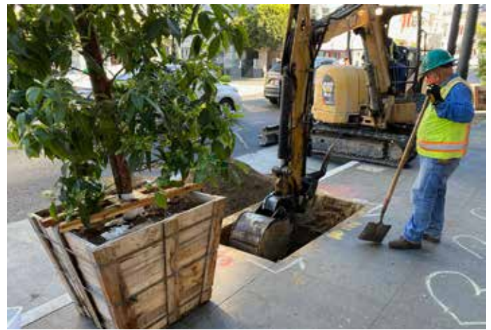
Irrigation pipes were added prior to the tree planting.

As promised, trees have been planted in spite of deep suspicions by us tree-huggers that the City, who removed trees on Haight Street for the refurbishment would leave the spaces empty. Much social media chatter was spent on this speculation. But now drought tolerant Australian Brisbane Box trees with large root structures are finding a home amid an awakening street culture. The moniker was long—"The Upper Haight Transit Improvement and Pedestrian Realm"