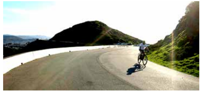
Including Twin Peaks Boulevard in the City's Slow Streets program may have been a miscalculation as complaints mount.

Because of complaints about increased congestion, car break-ins, littering, noisy gatherings and lack of access to the look-out point, the City's well-intentioned car ban on