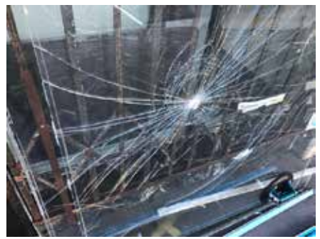
Vandals have broken windows twice at Berner's Cannabis dispensary on Haight St.

Currently reserved for D-5 businesses that gross less than $25 million annually, the program will allocate $1,000 per incident to qualifying shops for up to