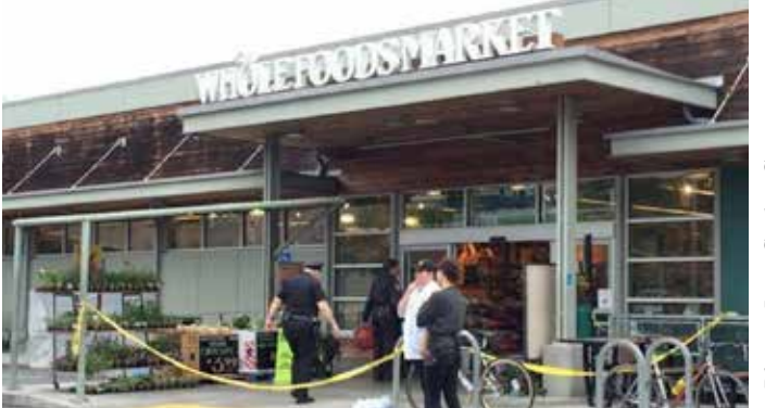
A security guard at Whole Foods Market was stabbed by an early morning shoplifter.

The assailant then took off in the direction of Golden Gate Park. Following information from witnesses, the police identified him at