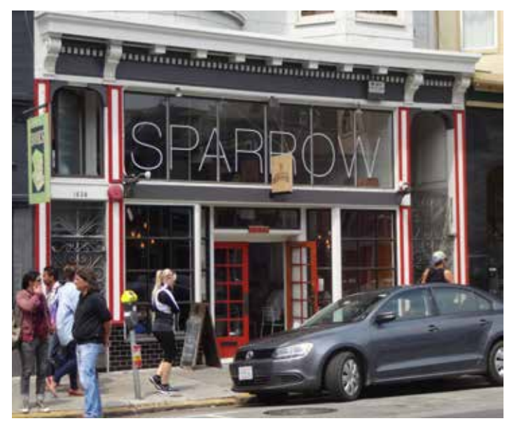
Imaginative food and a friendly staff are building a loyal clientele.

The menu has vegetarian, vegan, gluten free choices as well as plenty for the meat eaters to enjoy. The food is prepared with organic local products whenever possible. The preparations are simple yet