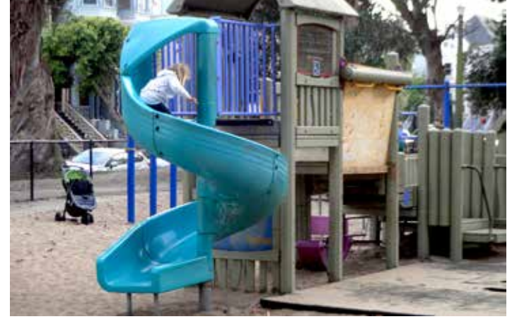
The Panhandle Playground, especially designed for children under six years old, has been left with a single usable slide and one tire swing.

The small playground in the Panhandle of Golden Gate Park has had its ups and lots of downs in the year our preschool has been using it. But, lately, it seems to have become totally invisible to Rec and Park. About 20 years ago the very old structures were replaced by a prefab system donated by a local Saturn dealership. The neighborhood grew restive over the fact that Saturn put a plaque, recognizing this, on the structure. The name had to go. Then a part of the equipment was discovered not to be ADA approved and that part had to go. Then, after a lot of usage, a clever little hand-cranked tramcar fell into disrepair and it disappeared. That left us with a two-