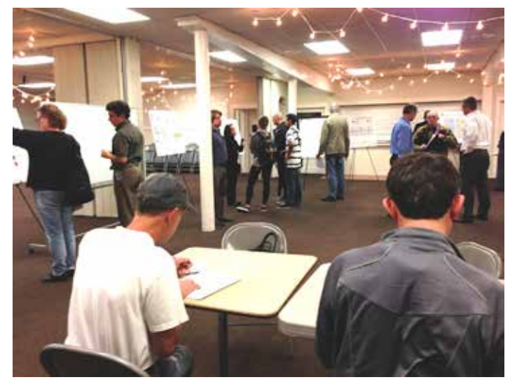
The workshop featured boards showing the various points of proposed traffic mitigation designed to speed up Muni. Afterwards, attendees were asked to provide written evaluations.

At a meeting at the First Baptist Church on June 23, the Municipal Transportation Agency revealed the changes they are proposing to Cole Valley and the Haight Ashbury. They focused mainly on speeding public transit. The bus stop is being removed from Cole and Haight. The stop on Haight and Buena Vista West will be moved