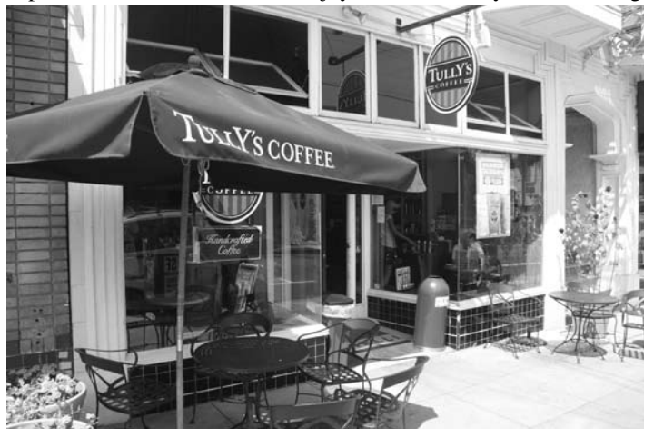
Ever since it opened, Tullys has been a gathering place for Cole Valley dwellers of all ages.

Kids Day at Tullys will take place on September 12 from 2 to 4 p.m. Children will be able to enjoy hot cocoa, story time, coloring