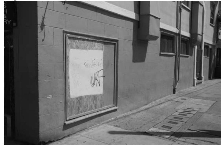
The wall at the northeast corner of Carl and Cole greets passengers disembarking from the N-Judah.

Meanwhile residents of Cole Valley are discussing another blank wall, this one at the corner of Carl and Cole, along the side of the Laundromat. As the N-Judah emerges from the tunnel, it is the first stop in Cole Valley. "There should be some well-designed mural