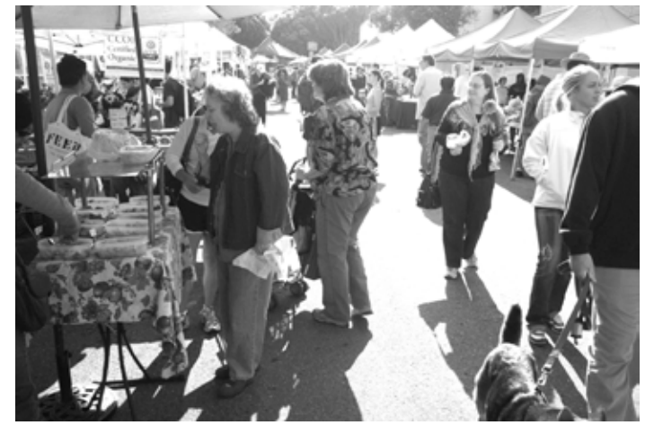
It didn't take long for Inner Sunset neighbors to make the new farmers' market a regular part of their Sunday morning.

The Inner Sunset Farmers Market opened with much fanfare on Sunday, June 7 with Supervisor Ross Mirkarimi and other notables speechifying and posing for pictures. The stalls are located in the