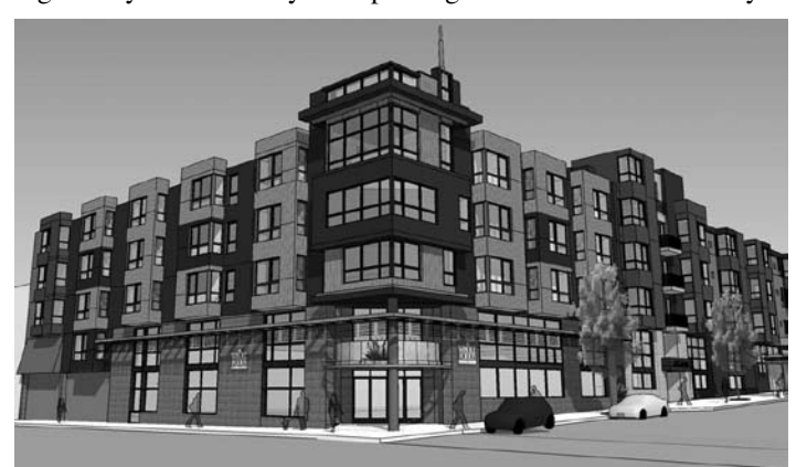
The large mixed-use project intended for the corner of Stanyan and Haight has been scrapped.

Is the deal on or off? That's what Cole Valley residents are asking as they look at the eyesore parking lot on the corner of Stanyan