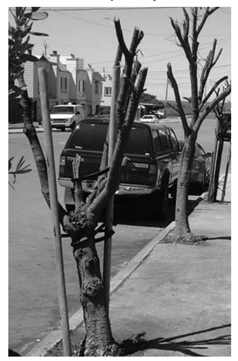
We are all responsible for the skilled pruning of the street trees on our property.

This topping is punishable by fine up to the actual 'replacement value' of the tree (Article 16, Sec. 811 of the Public Works Code). These trees do not grow back with viable new limbs as their attachments are weak and these branches ulti-