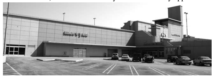
Marshall's will replace Mervyn's as the anchor store in the old Sears building on the corner of Masonic and Geary.

Mervyn's was one of the city's first large clothing stores to go under when the recession hit. The space on the corner of Geary and Masonic which for so many years was a Sears, has been dark for nearly a year. On August 6, clothing giant TJX (owners of TJ Max and Marshall's) announced that they had received city approval for