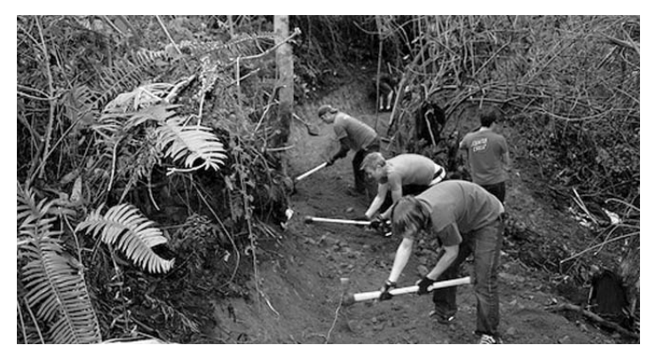
Even though Rec and Parks' entrance to the Stanyan Trail Head has been boarded up by neighbors, volunteers continue their work clearing the historic trails within Sutro Forest.

As nice an idea as it is to reopen this trail leading from Stanyan Street into Sutro Forest, it will disproportionately effect homeowners on either side of the trail. At the meeting, they stood firmly against the proposal. Their objections ranged from an increased danger of