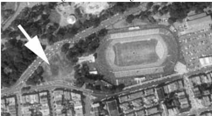
The neglected field on the periphery of Golden Gate Park is mainly used by UCSF employees who leave their cars in the park.