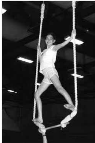
Circus Center student practices on the ropes.