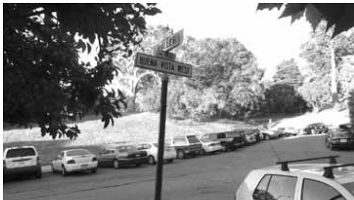
The proposed site is on Buena Vista West, close to areas of high use.

The design would be a "traditional" rectangular building with stucco walls, red tile roof, with separate men's and women's facilities containing "industrial strength" fixtures. All surfaces, both