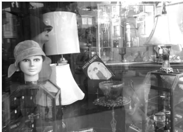
City regs are too stringent for small second-hand shop owners.

Recently, in its dogged attempt to increase the city's coffers, the authorities have been enforcing a ridged set of rules enacted to intervene in the fencing of stolen goods. It requires that owners of