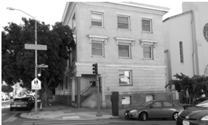
Built in 1904 as the Scobie Memorial Sanitarium, 1500 Page Street has been empty for five years.