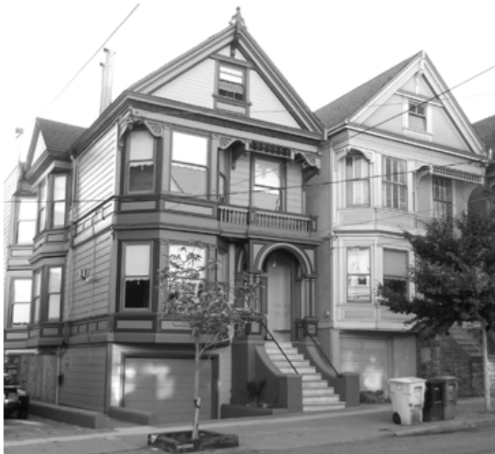
North of Panhandle (NoPA) is a treasure trove of Victorian buildings.

Noted Victorian builders of the picturesque style, including Cranston & Keenan, are represented in the North of the Panhandle (NoPA) neighborhood. Many of these homes feature curves, bays,