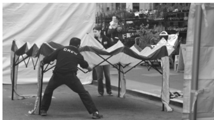
The Fair's set-up begins at 6 a.m. on Cole and Parnassus.

At 7 a.m. the vendors start arriving. Volunteers at all four intersections will greet the vendors and direct them to their booth space. A monitor at the Grattan parking lot will direct traffic there and pack in as many cars as possible — making sure that everyone