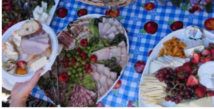
projected expenditures. Transit is funded by multiple sources. On the operating side, money comes from the general

But despite its glamorous leader, we learned that the MTA has serious problems. It faces a structural deficit, meaning that projected revenue will not keep up with the