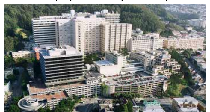
The purchase of St. Mary's will expand the influence of UCSF in the Inner Sunset and Cole Valley as well as cementing their position as a world class healthcare center.

St. Mary's Medical Center in San Francisco now loses $22 million per year. The 166 year-old hospital serves