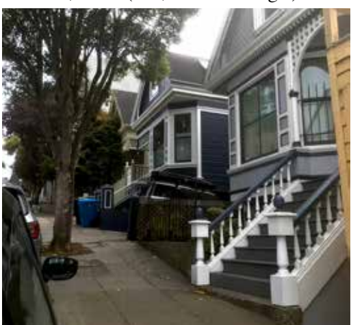
Even single family homes must be registered with the San Francisco Rent Board. A whiff of the Soviet State?

An ordinance was passed unanimously on December 8, 2022 by the San Francisco Board of Supervisors that established a mandatory inventory of all private residential property by March 1, 2023. (Yes, six months ago.) The reporting require-