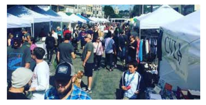
Widely known for being the most family friendly street fair in the city.

Sunset Mercantile is honored to continue the tradition of the Cole Valley Fair, in collaboration with CVIA—back for the nineteenth year—featuring fine arts and crafts, food booths, live music, historic Cole Valley photo exhibit, a