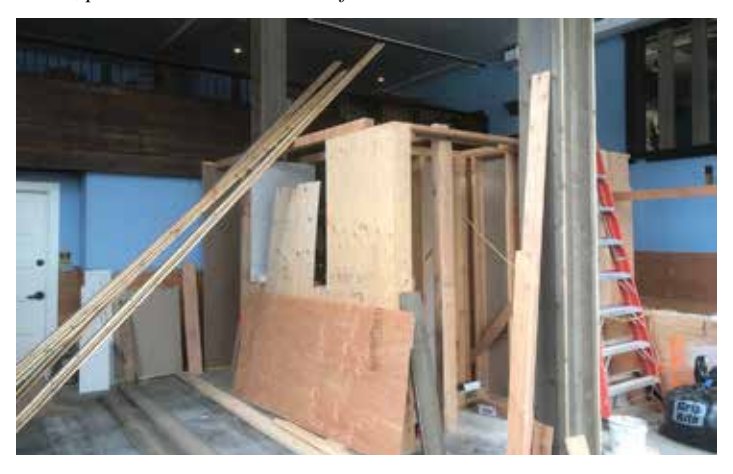
Anyone taking a peek through the door can see that a full-scale remodel is in progress—far from the original configuration of the old Ironwood restaurant of the last century. How long is our wait for the opening of the promised Blue Barn café? And does a sandwich shop duplicate nearby eateries?