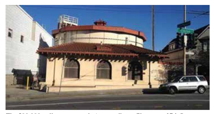
{\it The~500,}000~{\it gallon~water~tank~sits~proudly~on~Clayton~at~17th~Street.}

The large water tank at the top of Clayton Street has a direct connection to the Twin Peaks reservoir and has a total