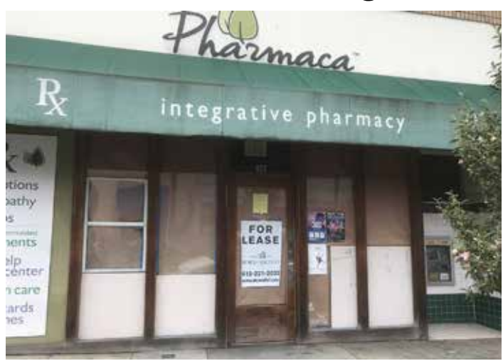
When Walgreens bought out the 22-store Pharmaca chain, no one knew what they had in mind, but recently a "For Lease" sign has appeared. Their website is soliciting other drug store owners to sell to Walgreens. So they'll be the last one standing? Or is it simply buying leases when the price is right?