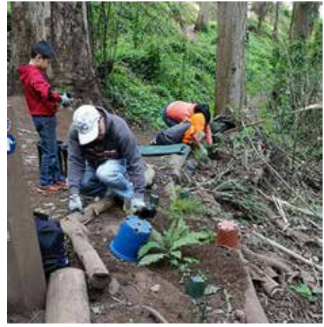
Volunteers take part in weeding and planting.

Join our community of Mountain lovers during our 2021 Membership Drive. This year we are so grateful to the Cole Valley Improvement Association for matching our membership drive dollar to dollar, up to $1500. This doubles the impact of your membership. Not only that, but, for one month