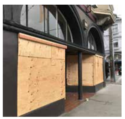
Can a Master Broker save the Haight?