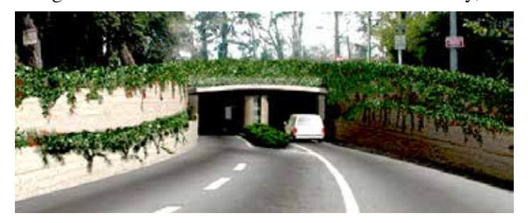
Concourse Garage parking fees cannot be lowered directly by the City.

The Music Concourse Community Partnership (MCCP), a 501 (c) 3 non-profit organization, was incorporated on August 14, 2001 to construct and manage the Music Concourse Garage after the Golden Gate Park Concourse Authority, cre-