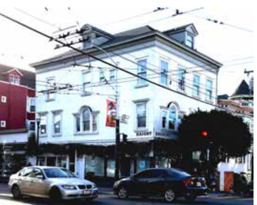
The Doolan-Larson House is now owned by the SF Heritage Foundation and open during select hours.