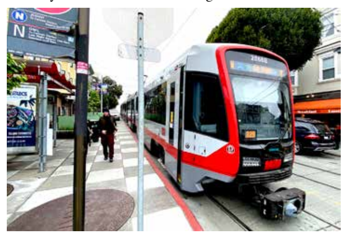
N-Judah trains have replaced the crowded shuttle busses..

The SF Municipal Transit Agency (SFMTA) restarted N-Judah rail from Ocean Beach to Caltrain on May 15. It's been a year with buses substituting for the rail service—