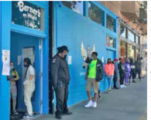
Traditionalists line up for cannabis at Berner's on 4/20.

You may have noticed cops posted at the east entrance