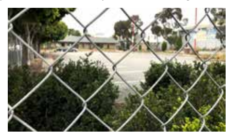
The promise of Prop A money is accelerating plans to develop the site's 38,000 square feet.

clude units serving formerly homeless households, and ground-floor commercial use serving the surrounding neighborhood at 730 Stanyan Street." A meeting of interested parties was held on October 2 to inform