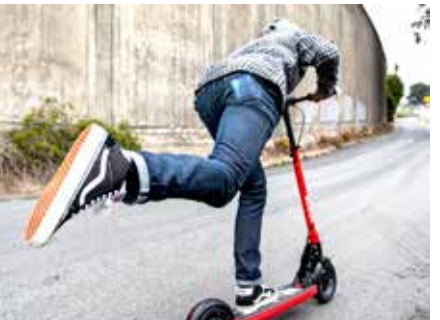
Scoot has been joined by competitors Jump, Lime and Spin. Each have 12-month permits to deploy up to 1,000 scooters.

The concern for Cole Valley is the possible disruption that scooters could cause. What Scoot promises is that they