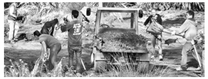
Join your neighbors in the upkeep of this very special oasis of calm. Many hands make light work, so please participate in this monthly effort.

Meet at Haight and Stanyan Street. Look for the Rec and Park vehicle to determine our location.