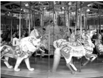
The Herschell-Spillman Carouset was built in Los Angeles in 1914.

The city has issued a “Request for Proposal” (RFP) for the Golden Gate Park Carrousel and Food and Beverage Concession.