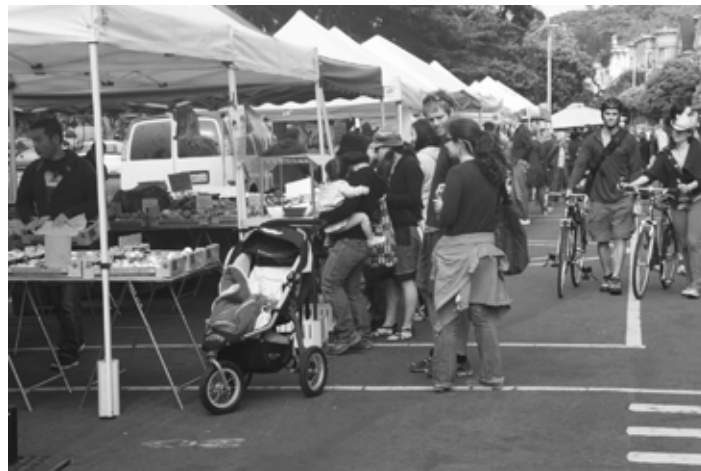
Neighbors meet amidst the tented vendors of fresh fruits, vegetables, flowers and bakery specialties.

The Upper Haight Farmers Market returned to Waller and Stan-yan Streets a few weeks ago. It opens a half hour earlier this year, at 3:30 p.m. every Wednesday afternoon and stays open until 7:30.