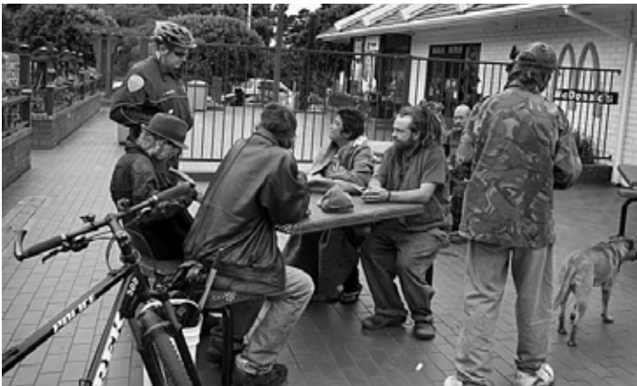
Each year the police receive hundreds of calls from McDonald's.