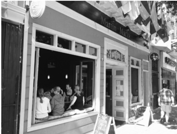
Management change has not diminished the popularity of Martin Mack's.

She said that although the change was "really devastating" for the bar and, of course, for the old staff, Martin Mack's is back open with the sole intent of remaining a fully operational, successful neighborhood bar. All of the employees under the former management were offered their jobs back, she said, and although she regrets