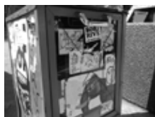
Vandalized newsracks "Political" plantings