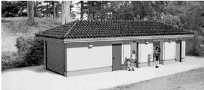
Neighbors were given the option of a traditional style (shown) or a bare-bones "contemporary standard."

BVNA requested this process for full and open community vetting, because we know there are strong feelings both pro and con