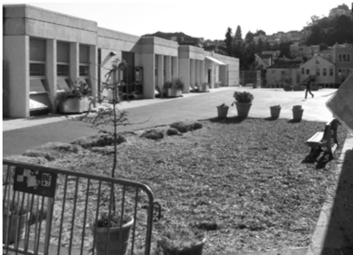
Grattan Elementary School will use the CVIA grant to purchase plants.

The profit CVIA makes from the Cole Valley Fair helps to pay for the Cleaning of Cole Street, which costs $900 per month. In addition, we traditionally give a grant to a community resource. In the last few years it has been the Grattan Elementary School Library.