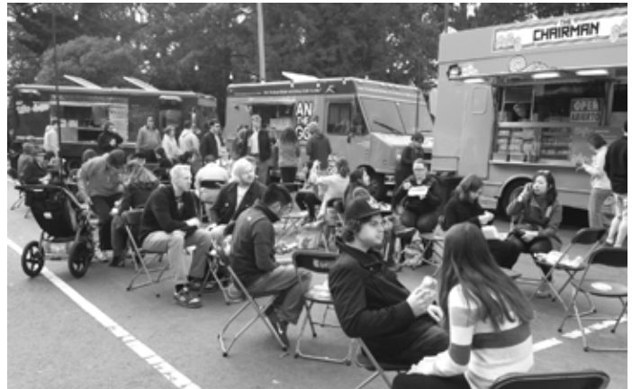
There is a growing spirit of comraderie among the Thursday fans.

The Off the Grid is a round up of food trucks held every Thursday nights on Haight (at Waller) from 5:00 to 9:00 p.m. It's growing rapidly in popularity as people discover how delicious (but not cheap) the offerings are. The strings of lights go up, the chairs are arranged, the soft jazz starts playing and somewhere between 10 to 13 trucks show up with a range of food from the pork buns of Chairman Bao, the Chicken Tiki Massala burritos of Curry Up,