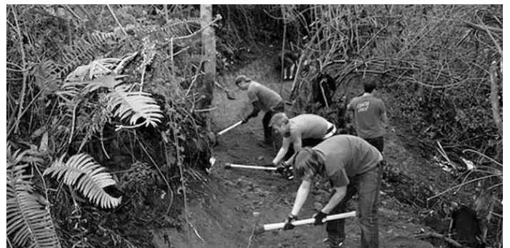
In Cole Valley’s own wilderness, the Mt. Sutro Stewards have discovered and cleared old trails and maintained them with devotion.

Do you love your trails? National Trails Day offers the opportunity to give back a little love to something that gives great joy to so many. Come out for a morning of Trail Stewardship and