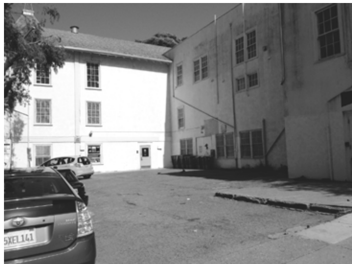
The group of buildings owned by the Methodist Church at Waller and Belvedere may become a camping and retreat center.

The Julia Morgan building at 1525 Waller Street, once the home of the Hamilton Methodist Church, and still owned by the United Methodist Church, has seen only sporadic use for the last few years. A Saturday food pantry for low-income people has been its only recent function—a waste of such a large amount of square footage, which includes a sacristy, commercial kitchen, second floor office space, gymnasium and parking lot. Recently we have been informed that there are plans to establish a “camping and retreat facility” there. It hasn’t been confirmed but we do know the idea was presented at the Methodists’ California-Nevada annual conference. After the