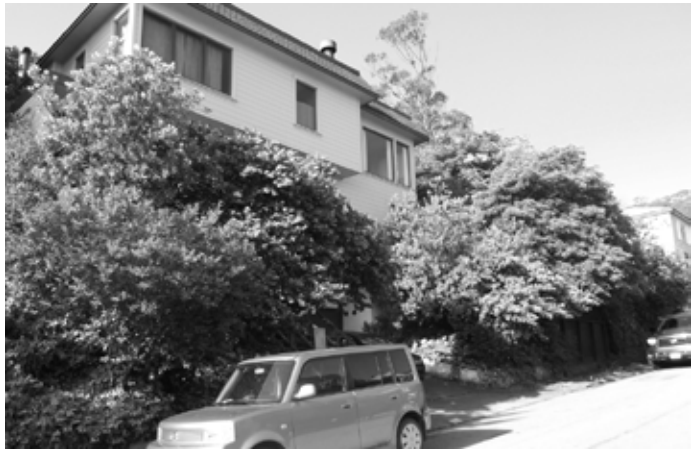
A proposed Belgrave lot split was successfully halted by neighbors.

Several years ago a Petaluma developer purchased a property on Belgrave Avenue. He then applied for a variance to split the existing 75 foot front lot into two separate pieces. The new lot