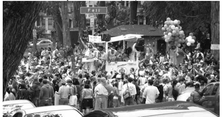
The floats, booze and mayhem of past years reached critical mass in 2010. Since then there has been strict monitoring by police.

The annual 12k race will start at 7:30 a.m. and end at noon. As was the case last year, there will be zero tolerance for floats, alcohol, wheeled objects or animals at this year's Bay to Breakers 12k foot race. Registration is required of the estimated 34,000 entrants. There will be 1,200 portable toilets on the route. First aid and emergency medical care will be provided, as always, by the American Red Cross.