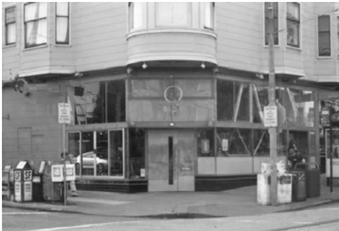
Neighbors were given the option of a traditional style (shown)

In spite of CVIA's recommendations, and the Planning Department's more liberal recommendation that the restaurant close at 12:30 a.m., the Commission members at the May 3 hearing granted the owners a Conditional Use Permit, stipulating that "all operation must close at 1:00 a.m. on Thursday Friday and Saturday nights." For other nights the premises must shut down at 12:30 a.m. In the