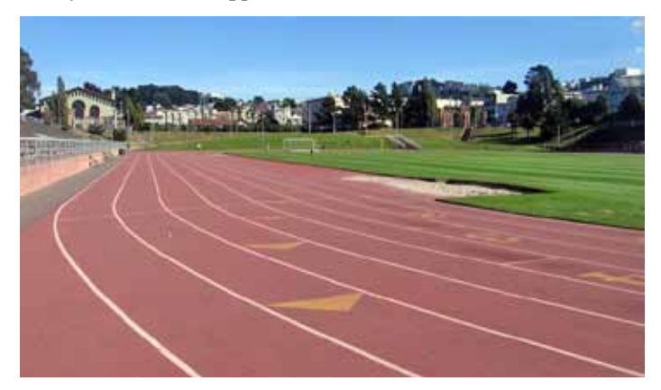
The Kezar track serves not only school athletic programs but also organized adult groups such as "Boot Camp," as well as being an integral part of the personal exercise regimens of scores of Cole Valley neighbors.

CVIA, along with other members of the committee and community, made several appearances before the Recreation and Parks