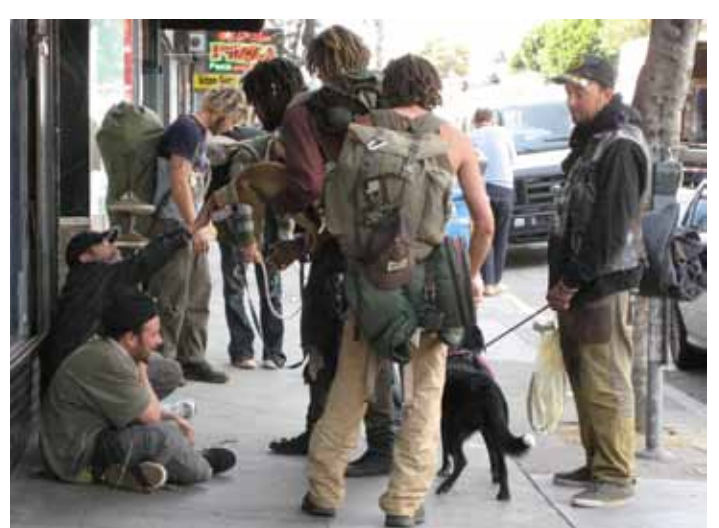
Doing business on Haight Street has unique challenges.

■ Pass a city ordinance (like that in Santa Cruz on Pacific Avenue.) That there are "No dogs allowed" between Masonic and Stanyan Street and a one-block radius. People who live here and need to walk their dogs would be issued a permit. Since we now have the "no sit, no lie" ordinance, the transient kids are now standing, with