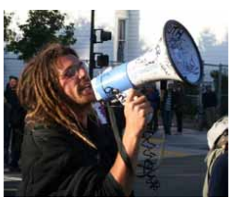
Urban gardeners protest the closing of Hayes Valley Farms.

To those of us who lived through the protracted honing of the Market Octavia Plan (infill transit-oriented housing replacing the downed freeway), it was bitterly ironic that the Hayes Valley