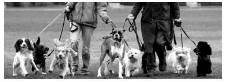
Cars carrying multiple dogs must now be inspected by the city.

At the beginning of July, new regulations for dogwalkers went into effect. They must now have liability insurance, carry leashes with them at all times, obtain a permit from the city, receive train-