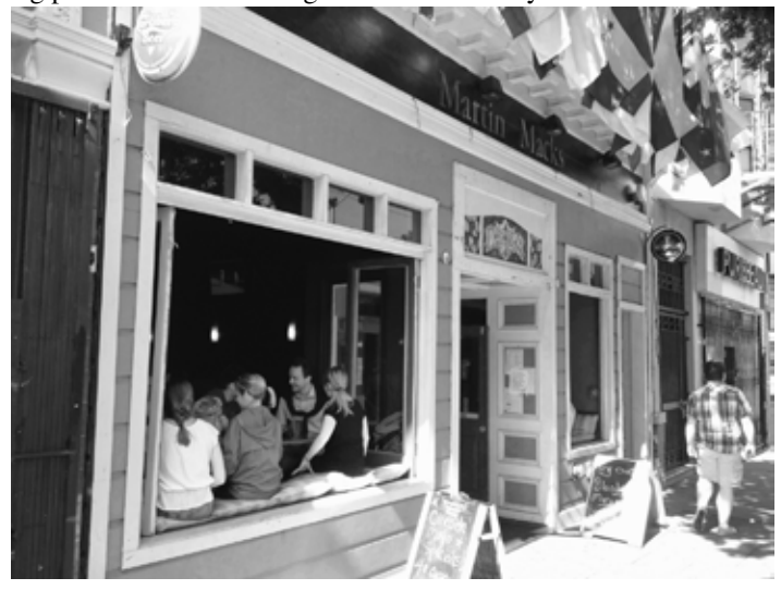
With the opportunity to sit in an open window while enjoying a brew, maybe Martin Mack's didn't need the parklet after all.

It was with mixed feeling that I watched the curbside brick structure in front of Martin Mack's being deconstructed. Not because I loved it. No, it was underused and misused, with a series of hanging plants that went from green to brown in cyclical rotation. But I