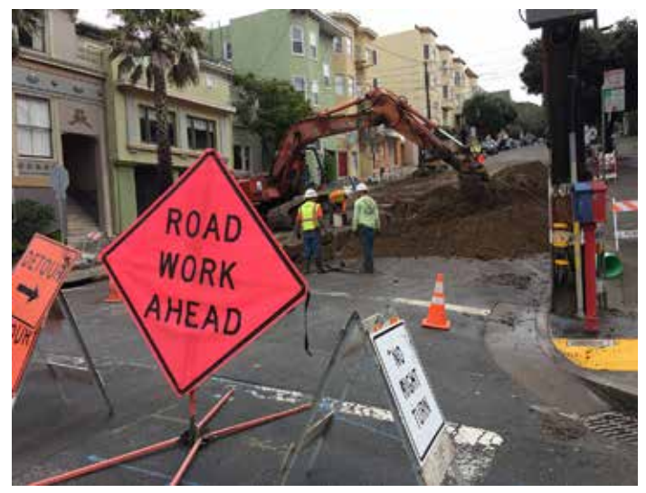
The Department of Public Works is methodically replacing the city's ageing sewer lines, some over one hundred years old. Neighbors watched as crews used excavators, front-end loaders and concrete mixers as part of a 20 year plan for infrastructure improvement.