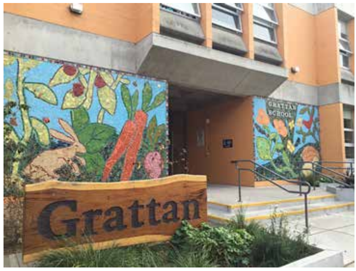
Grattan students range from pre-kindergarten through fifth grade.

Had the KQED-FM fundraising drive not been going on, I never would have tuned in to KALW on a Monday night, where the Board of Education's semi-weekly meeting was being broadcast. After hearing about sensitivity training for SF teachers with students who are Inuit