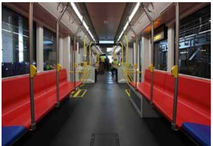
Muni's first brand-new Metro train is expected to begin testing along the N-Judah line immediately.

More than 100 passengers a day are typically unable to board a N-Judah because of overcrowding, said SFMTA spokesman Paul Rose.