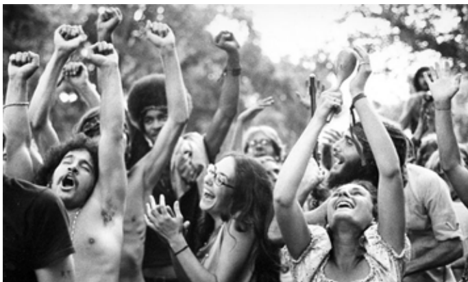
No, it won't be exactly like 1967 but the impact on the neighborhood will be enormous.

According to Sunny Powers (owner of Love on Haight, 1400 Haight St.), the focus will be on the neighborhood's stellar street clean-