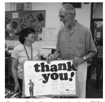
Grattan School expresses thanks to CVIA for significant contributions to their library book fund.

Although we are primarily a resident group and are active members of the Coalition for San Francisco Neighborhoods (CSFN), we never forget how important a healthy commercial district is in the wellbeing of the community and value our merchant members. In the seventies, Haight Street was a dead zone of boarded-up