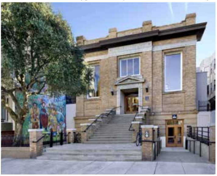
The venerable 1909 building is the neighborhood's jewel.

Did you know that our own Park Branch Library at 1833 Page Street is the oldest existing public library in San Francisco? Although