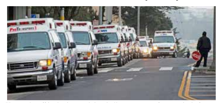
Hospital staff had rehearsed the challenging move for months before.

They did it. UCSF managed to move 120 patients from its medical center on Parnassus to its new hospital complex in Mis-