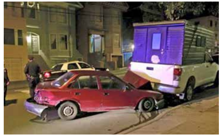
Neighbor Jeff Gubitosi captured this shot in front of The Ice Cream Bar.

'So, the loud bang was a car barreling into a parked truck in front of The Ice Cream Bar. They think it was two guys. One climbed up scaffolding on one of the houses on the east side of Cole and broke a window. One of the residents was cut up pretty badly trying to stop him. There were probably five cop cars within a minute but almost 15 to get an ambulance. What's going on in our hood? Ellen Fitch Curry added, "I heard the neighbor who was