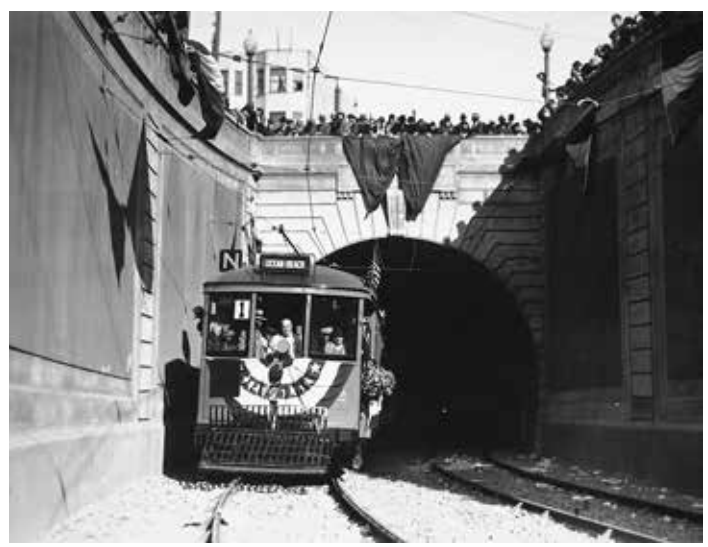
Crowds gathered along the top of the Sunset Tunnel on opening day, October 21, 1928. Pictured is Mayor Rolph driving the streetcar on its maiden trip through the western portal en route to Ocean Beach.

But, hold on. Haven't we been waiting for these track improvements for a decade? Already we have seen the improvement