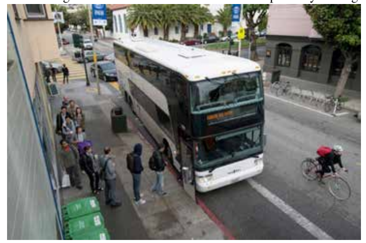
Corporate shuttles prove to be a mixed blessing.

On the minus side there is less access to Muni buses at the "Google" stops and some neighbors in Cole Valley have reported buses idling on the side streets for 10-15 minutes—probably waiting