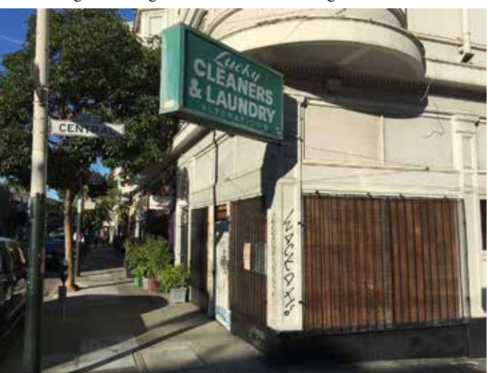
The former Lucky Cleaners at 1300 Haight Street may soon become Ritual Coffee Roasters' fourth San Francisco location.

Ritual Coffee Roasters is a sophisticated marketer. Among other things it instagrams whimsical messages such as this, last