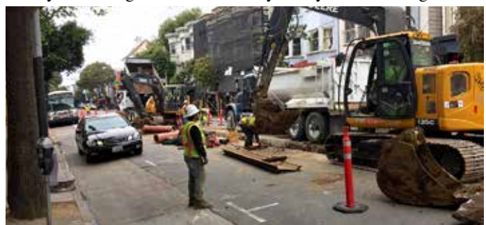
The city is combining needed sewer and water main replacement with long planned transit upgrades including bulb-outs, curb ramps and bus pads.

The problem is, that this would be the perfect time to install the pedestrian-level lighting so long needed on Haight Street. But the city is balking. Too much money, it says. Even though it was