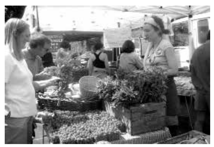
The Wednesday Market had a slow start this year.

The Wednesday afternoon market at Stanyan and Waller, was supposed to have been modified this year after feedback