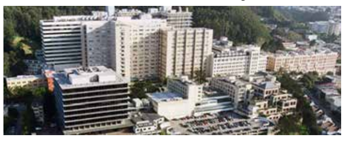
In 1976, UCSF neighbors forced the regents to put limits on its maximum square footage. For that reason, UCSF is demolishing smaller buildings to convert office space into housing, which doesn't count against its limit.

Implementation of the plan's streetscape component will start later in the year in the Clinical Sciences building area and involves increasing pedestrian safety with bulb-outs that shorten crossing distances as well as better provision for delivery vehicles. This means a loss of significant parking on Parnassus. Pedestrian level lighting will also be included as well as trees to make the area more welcoming and reduce the wind