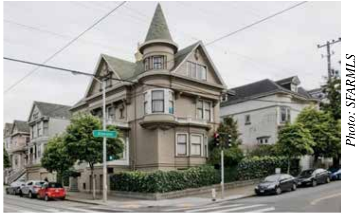
One of Cole Valley's preeminent Queen Anne homes got a quick fix.

Last year, the historic mansion at 199 Carl Street at Stanyan appeared on the market sporting dated wall-to-wall carpeting, a kitchen out of the 1950s, and a shabby backyard. It went into contract for $3.15 million after just a few weeks on the market and sold in April. At the time, one commenter pleaded, "Please