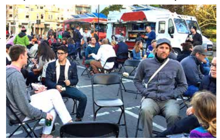
Off the Grid on Thursday evenings draws the largest crowds to the Waller Street Plaza. More permanent concrete skateboard structures are incompatible with this neighborhood multi-use space.

But that isn't even the main objection neighbors have to these enhancements. It's the noise. There has been an agreement that the skate park would concentrate in the west side of the space, closest