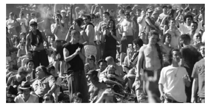
Rec and Park bore the cost of the cleanup after the invasion of Sharon Meadow and Hippie Hill on Monday, April 20.