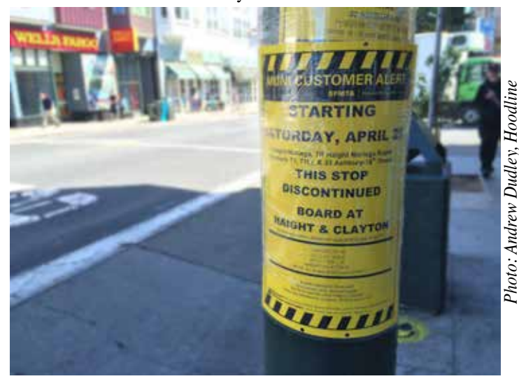
Reduction in stops is one of many "streamlining" steps in increasing transit effectiveness.

It's hard to believe that Muni would cut the Cole Street stops, but their research has found they are underutilized. This means that