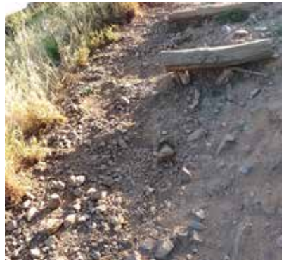
The Tank Hill steps to Belgrave present increasing danger to walkers.

Closer to home, HANC asked the Mayor for improvements in