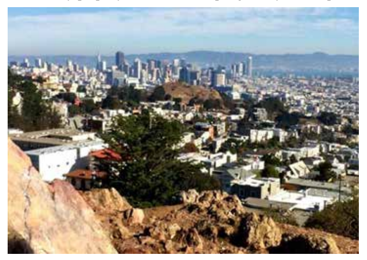
Cole Valley's vista point still has remnants of the original water tank...

Tank Hill gets its uninspiring name from the Clarendon Heights Water Tank built in 1894 by the Spring Valley Water Company to store drinking water pumped from Laguna Honda. Tank Hill became city property in 1930 when Spring Valley was acquired