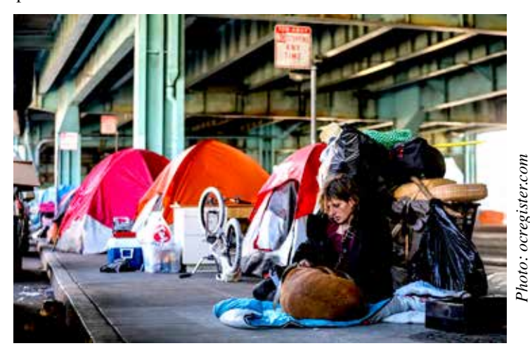
In his effort to eliminate the city's illegal urban campgrounds, the Mayor created a free-style "Navigation Center," which was deemed a success. Now, each supervisorial district is expected to provide the same. Of the ten neighborhoods in District 5, why is the Haight being targeted?

The neighborhood is very concerned with the potential use of Recreation and Park land for housing and servicing indigent people. We have in fact been experiencing this for 30 years and the state of our parklands reflects the abuse. We want our parks back and do not want recreational land used for other purposes. We trust that any site discussions for a Navigation Center in the Haight Ashbury will involve the neighborhood groups including Cole Valley Improvement Association.