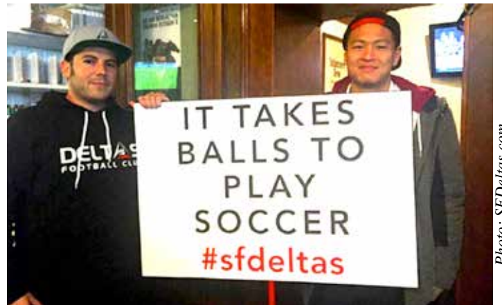
Although the Rec and Park Commission has since approved the sale of alcohol, if unruly behavior results, neighbors will have an opportunity to intervene in the issuing of a permit for the subsequent game.

I have a list of 29 people who are interested in working to