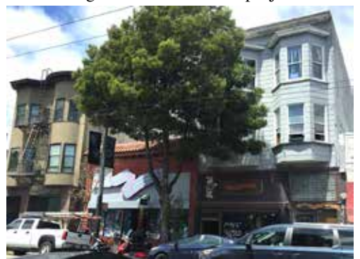
When trees obscure the Haight's old buildings is a tragedy or a blessing?

has succeeded in postponing the project's start date to after the summer of next year. Because 2017 is the 50th anniversary of the Summer of Love, merchants anticipate more than the usual crowd of tourists to the neighborhood.