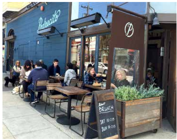
Three Cole Valley businesses hope to remain open during retrofit.

New laws regarding the seismic retrofit of "soft story" buildings with five or more units have caused a disruption in Cole Valley's small businesses. Tantrum has had to relocate temporarily to Clement Street but they plan to return when construction is completed in late summer. Urban Mercantile is closing — maybe this month — for