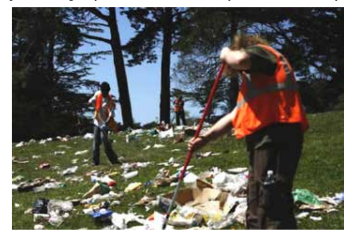
Unofficial, unpermitted and illegal, 4/20 drew an estimated crowd of 15,000-apparently, none Sierra Club members.

What is quickly becoming a date as venerated as Christmas, "Four-Twenty" (4/20) appears on the calendar, not only of every pot-smoking Bay Area resident, but every San Francisco City