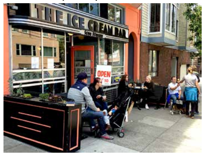
The Ice Cream Bar was just one target of recent break-ins.

Yes, yes, everybody is now aware of the New York Times and Atlantic articles citing San Francisco with the highest rate of property crime in the nation. But does this actually impact the Haight and Cole Valley? First and foremost are car break-ins. Cars with items visible in the interior are targeted by "smash and snatch," an average of 70 per day citywide. Cars that are left unlocked are the favorite of the passive "try all doors" actor. Bike theft is so