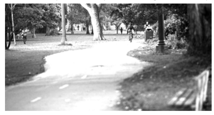
This vital strip of greenspace continues to be a multi-use resource for all ages.

The MTA has budgeted $705,000 for studying/implementing improvements at the Panhandle's entrance and exits. Namely Baker, Shrader and Stanyan streets. They have also completed a feasibility