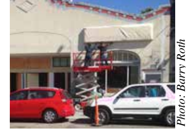
The GoHealth-Dignity sign was not well received among Cole Valley neighbors.