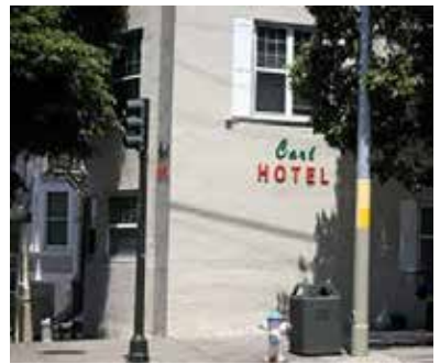
Opportunity is still knocking to join the hospitality industry without leaving the 'hood.

The old Carl Hotel was on the market this summer for $5,395,000, down from $5,600,000 a few months earlier. As far as we know it is still