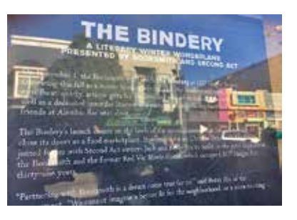
After Christmas The Bindery will briefly close for a reconfiguration of its interior.

expand its dining space. But the marketplace area was breaking new ground. With five stalls of 100 square feet each, the businesses didn't have an established customer base so, after a promising start, and some remarkably creative vendors, sales were not enough to keep the artisan providers in business. One by one, they closed. While the 49-seat