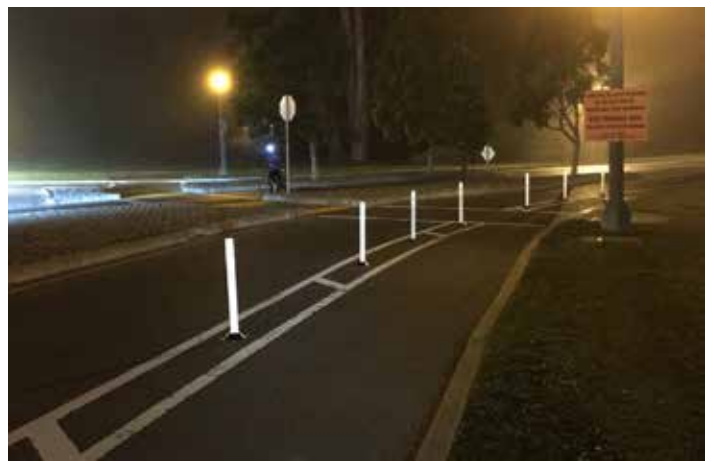
Guerrilla cyclists have installed their own safety markers.

themselves San Francisco Transformation (SFMTrA) who have had it with fatal accidents and close calls with cars and trucks strafing them in the city's bike lanes. At their own expense they decided to place soft upright markers on Fell Street along the Panhandle and elsewhere to protect riders from cars. On their latest Twitter post, they say that they can be found "...at the Crossover Drive crosswalk in Golden Gate Park,