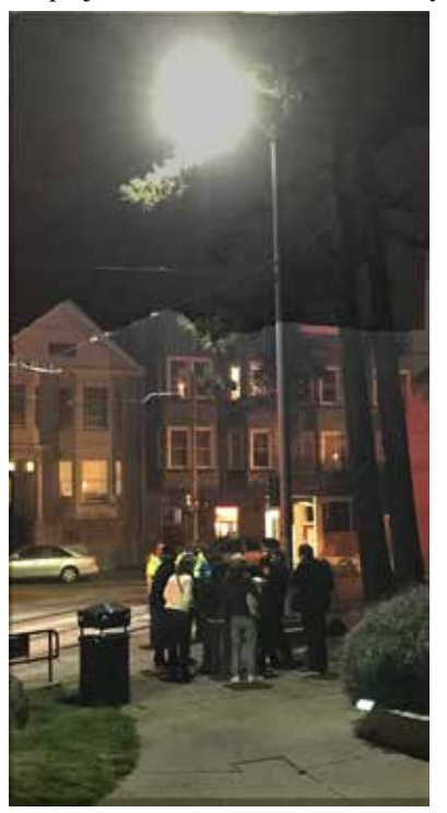
Neighbors gathered for a demonstration of newly installed LED units equipped with louvres to direct light onto pathway and away from houses.

On Wednesday, September 28, SFMTA employees involved in the project met with sixteen Cole Valley residents to show and explain