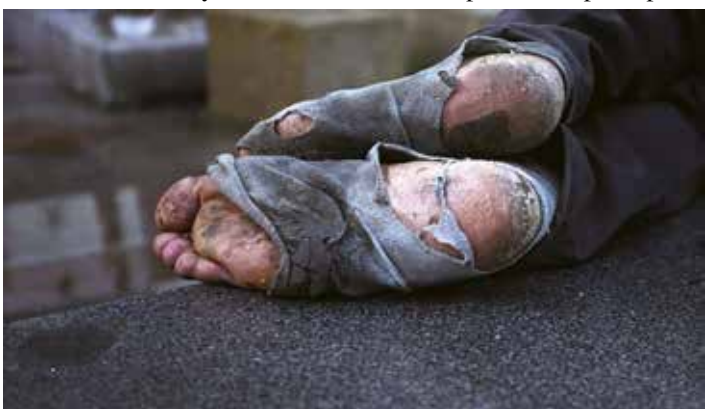
Proposal would unite efforts of treatment programs and the criminal justice system.

The creation of the BHJC may require legislative and regulatory steps to be taken that, at a minimum, ensure that the individuals who access services through the Center maintain all rights and privileges traditionally afforded in a custodial setting. As a nation, we have recently entered a long-overdue era in which there is unprecedented bipartisan collaboration designed to achieve both criminal justice and mental health reform. As a national leader in the effort to reform both of these systems, San Francisco and is well-positioned to pioneer these important changes. The plan is opposed by the Coalition on Homelessness and other homeless advocacy groups that are wary of any institution that confines the mentally ill. However, most of the plan allows participants